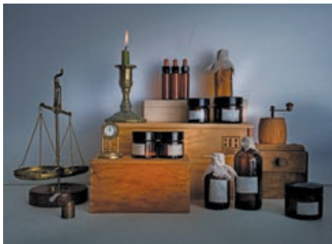
| Alchemy tools