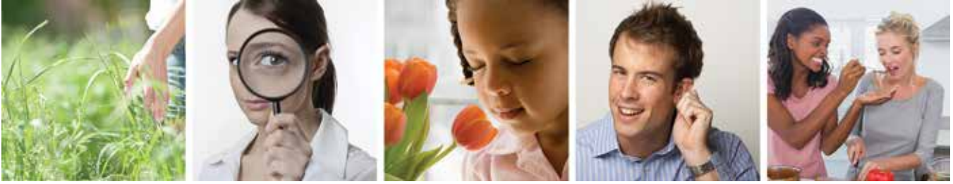
| Our Five Senses