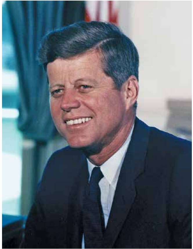
| John F. Kennedy

One of Kennedy's greatest domestic achievements was the push he gave the American space program. In April of 1961 a Soviet cosmonaut became the first person to orbit the earth. On May 25, 1961, Kennedy challenged America to put a man on the moon by