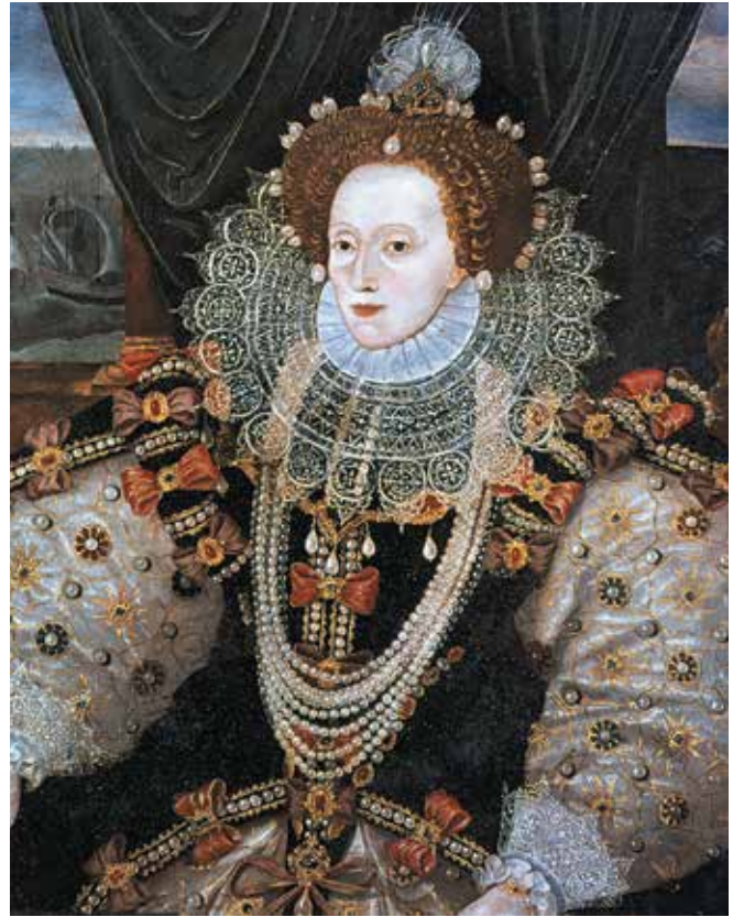
| Elizabeth I

Philip II of Spain sent the "Invincible Armada" for three reasons. First, Spain resented English aid and interference in the Netherlands. Second, the Armada was a religious crusade. Philip wanted to return England to the Catholic Church. Third and most important, Spain wanted to stop English interference with its