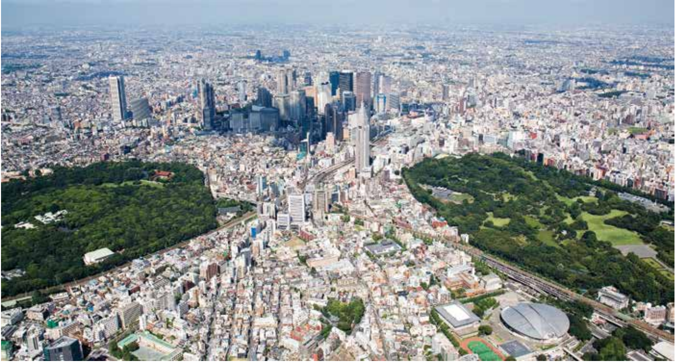
| Urban Growth

been easy. In this adjustment both parents may need to work. City living is much more expensive than living on the farmer's own property. These changes put many pressures on the family to maintain the same socioeconomic level. Adjusting to the city environment is difficult for many. During the last several decades a continual reduction has taken place in the number of farm workers. Many unskilled people who were not farm owners but who made their livelihood harvesting crops have also been displaced. As a