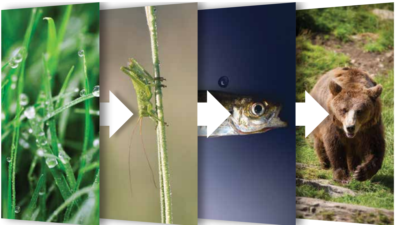
| Food Chain

High phosphate levels found in many soaps caused some lakes and rivers to become choked with fast-growing weeds and other plant life. This plant life multiplied so rapidly that some of the waterways became clogged