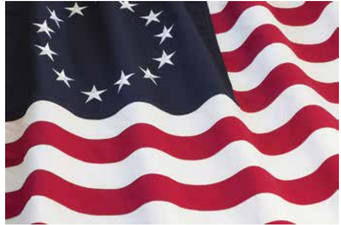
| An Early U.S. Flag

Mercantilism. The popular economic theory of the 1700s was mercantilism. This theory held that only gold or silver was real wealth, and countries must work to obtain more of