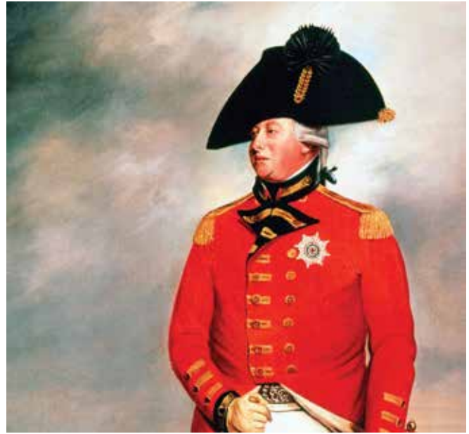
| George III, King of England

One of the more damaging laws forbade the colonies to mint coins. British merchants could