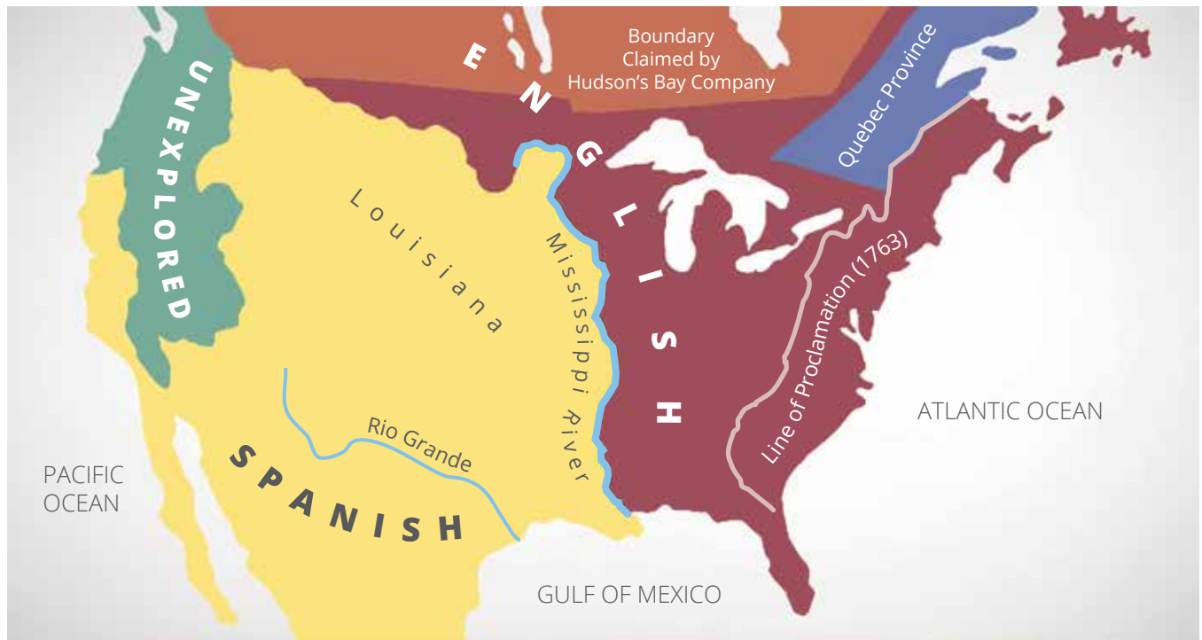
| The American British Empire in 1763

it. Colonies were used to doing this through trade. Colonies were to supply the mother country with raw materials such as wood, iron, and indigo. Then, the colonies would be a market for goods manufactured by the mother country, like cloth, hats, and tools. The colony was not to compete with the mother country by building its own manufacturing and industry. This theory held that the colony only existed to