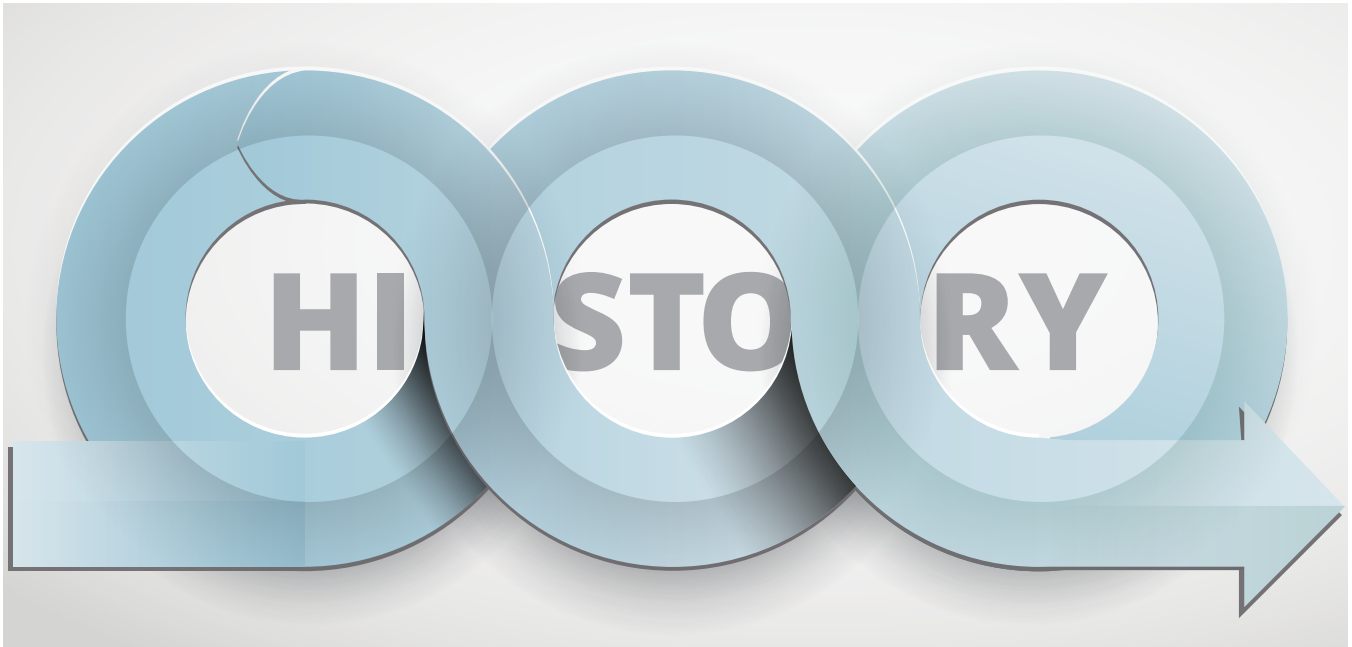
| Cyclical View of History

The Hebrews believed history was the story of man's ultimate purpose as he related to God. To Christians, history is the record of man's creation and fall, Christ's redemption for sin, and God's provision for man's eternal existence. This view of history is called linear history because it has a beginning and an ultimate end. The total picture of history can be found in the Bible, the record from Creation to judgment and eternity.