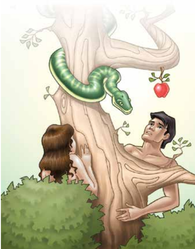
| Adam and Eve affected life before Christ.

Finally, you will learn how human life has both changed and remained the same after the appearance of Jesus Christ. People can now live a new life because of Christ. When people have new life in Christ, they can live in a way that pleases God and prepares them to be with Him forever in heaven. The final part of this first section of the LIFE-PAC will explain more about the possibilities of this new life in Christ.