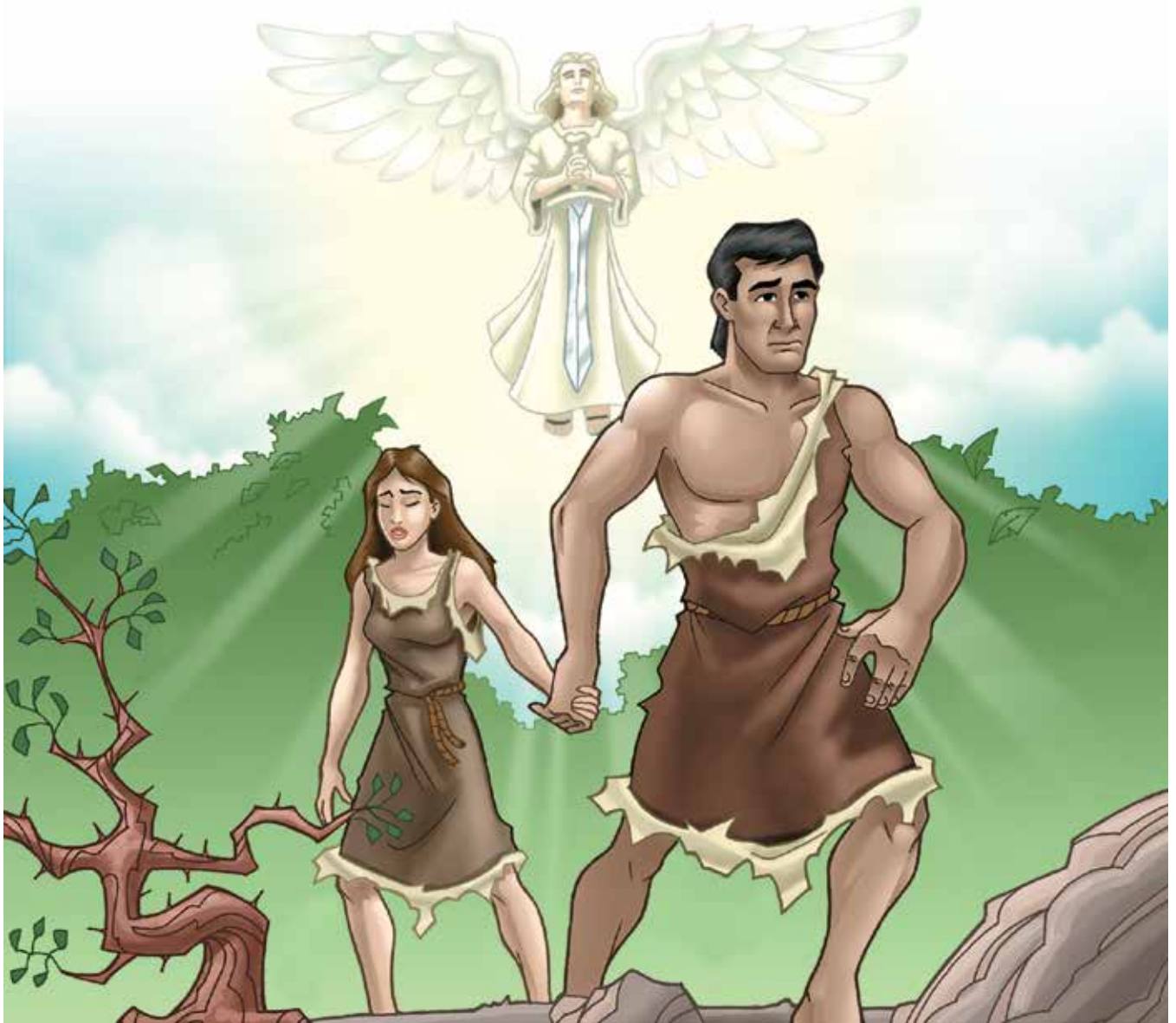
| Adam and Eve were expelled from the Garden of Eden.

made these changes hold true for all humans thereafter. In other words, the sin of Adam and Eve would affect all human beings after them. All human beings would now have lives characterized by sin. All human life from that time forward would be trapped in the condition of sin. The apostle Paul wrote, "Wherefore, as by one man sin entered into the world, and death by sin; and so death passed upon all men, for that all have sinned" (Romans 5:12). Paul also wrote in (Romans 3:9–12).