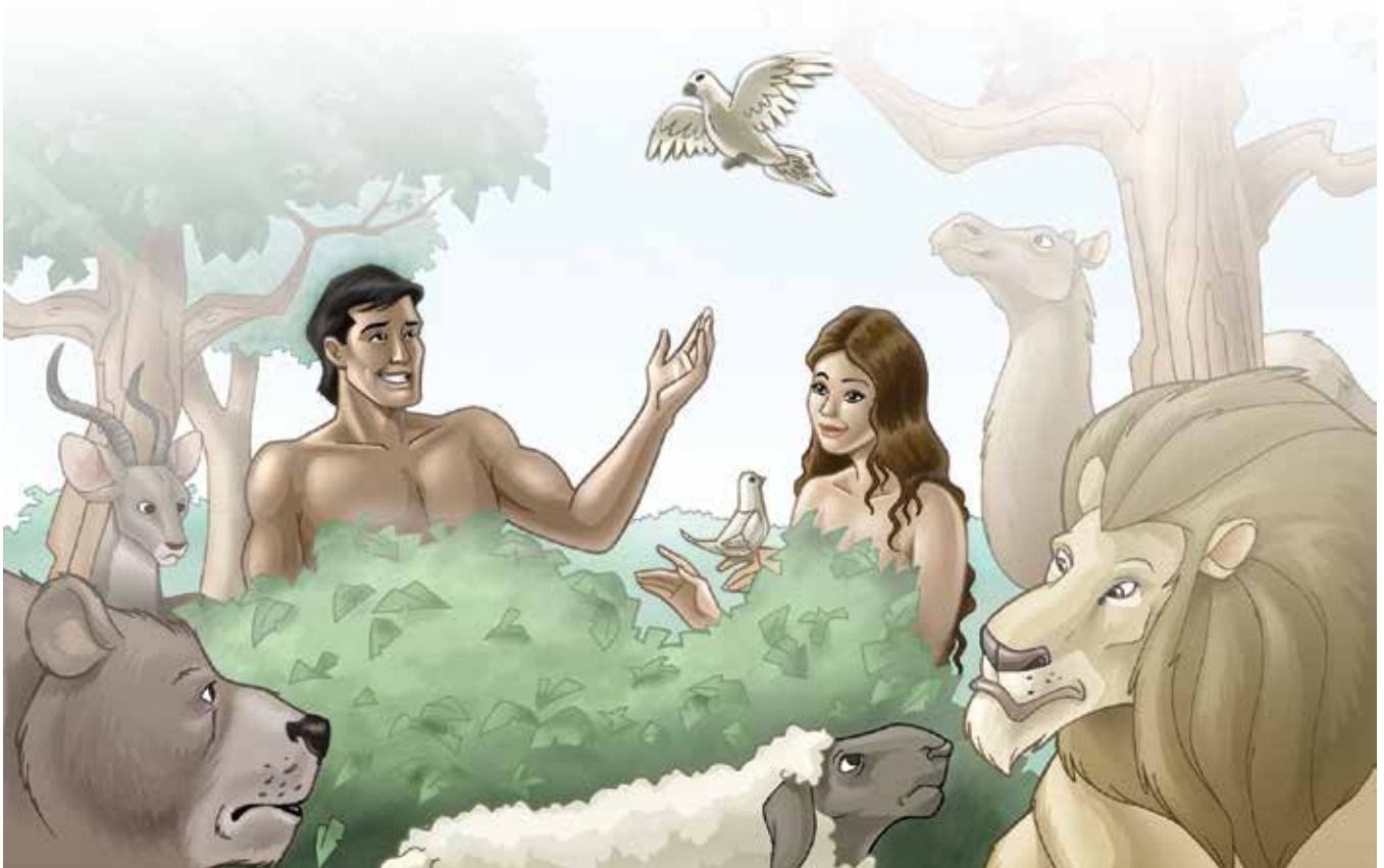
| Original Paradise