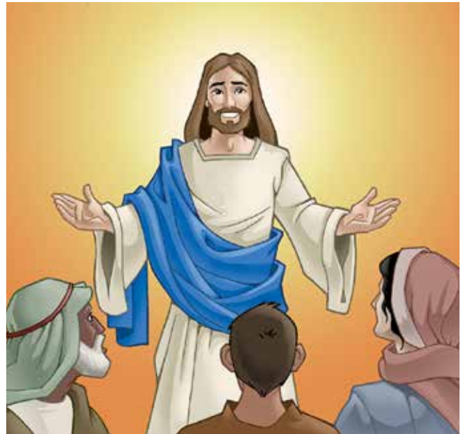
| Jesus came to give us new life.

First, you will examine life before Christ. You will learn about God's initial creation of our first parents, Adam and Eve. Created good and in the image and likeness of God, something