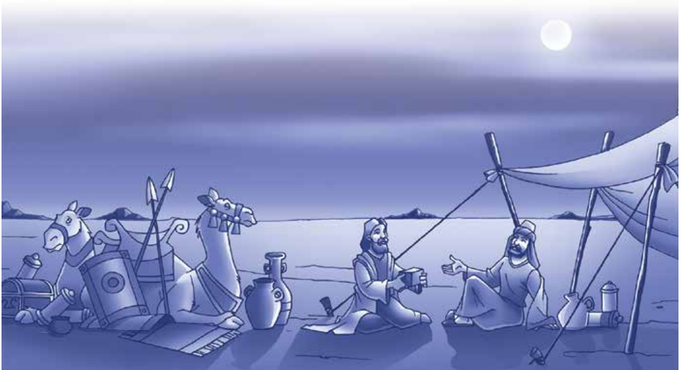
| Abraham and Melchizedek

The Old Testament priest had to present a lamb without blemish as sacrifice to God for sin. Hebrews 7:22–28 describes the priestly office which Christ would hold. Hebrews 7:25